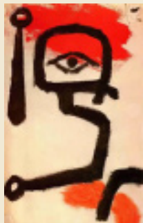
Paul Klee, "Kettledrummer," 1940