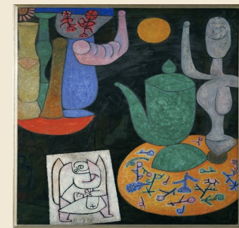
Paul Klee, "Untitled (Last Still Life)," 1940

Reading, Q & A, Reception with a book signing