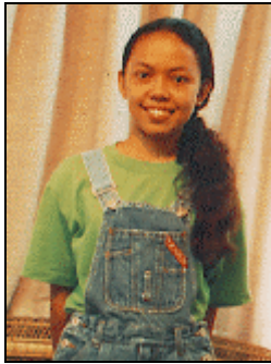
Filipina Girl from Catalog

expect to marry gentlemen that are 10 to 20 years older” (Toms, 1995).