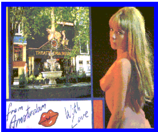
Sex Tour Advertisement for Amsterdam

As prostitution has become a form of tourism for men, it has become a form of economic development for poor countries. Tourism was recommended by the United Nations, the World Bank and United States advisory boards as a way to generate income and repay foreign debts (Lee, 1991). States set their own tourist policies and could, if they wanted, prevent or suppress the development of prostitution as a form of tourism. Instead, communities and countries have come to rely on the sale of women and children’s bodies to be their cash crop. As the sex industry grows, more girls and women are turned into sexual commodities for sale to tourists. In the bars in Bangkok, women and girls don’t have names – they have numbers pinned to their skimpy clothes. The men pick them by number. They are literally interchangeable sexual objects.