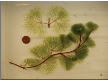
Size of fanwort relative to a penny