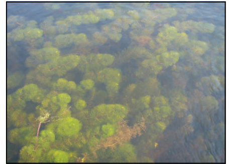
Dense stand of fanwort