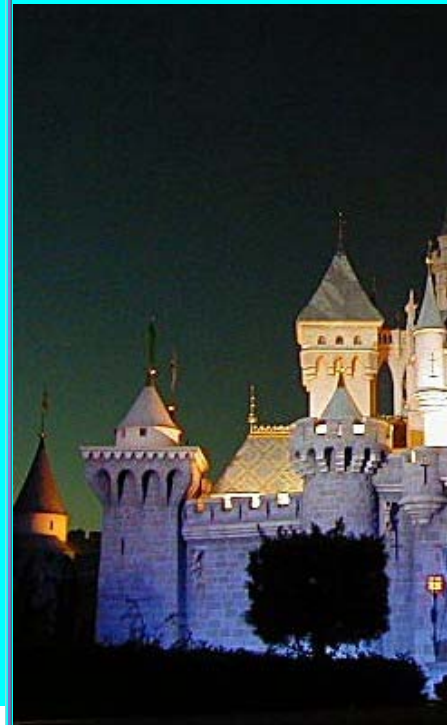
Disney Land, Los Angeles