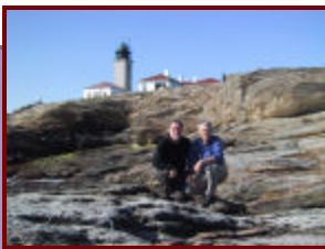
2002 Conference participants enjoying autumn in Rhode Island

Lodging: To reserve a room in the Crowne Plaza Hotel , call 401-732-6000 or 1-800-227-6963. Please mention that you are part of the International Engineering Colloquium. The conference rate for rooms is $135 per night plus tax.