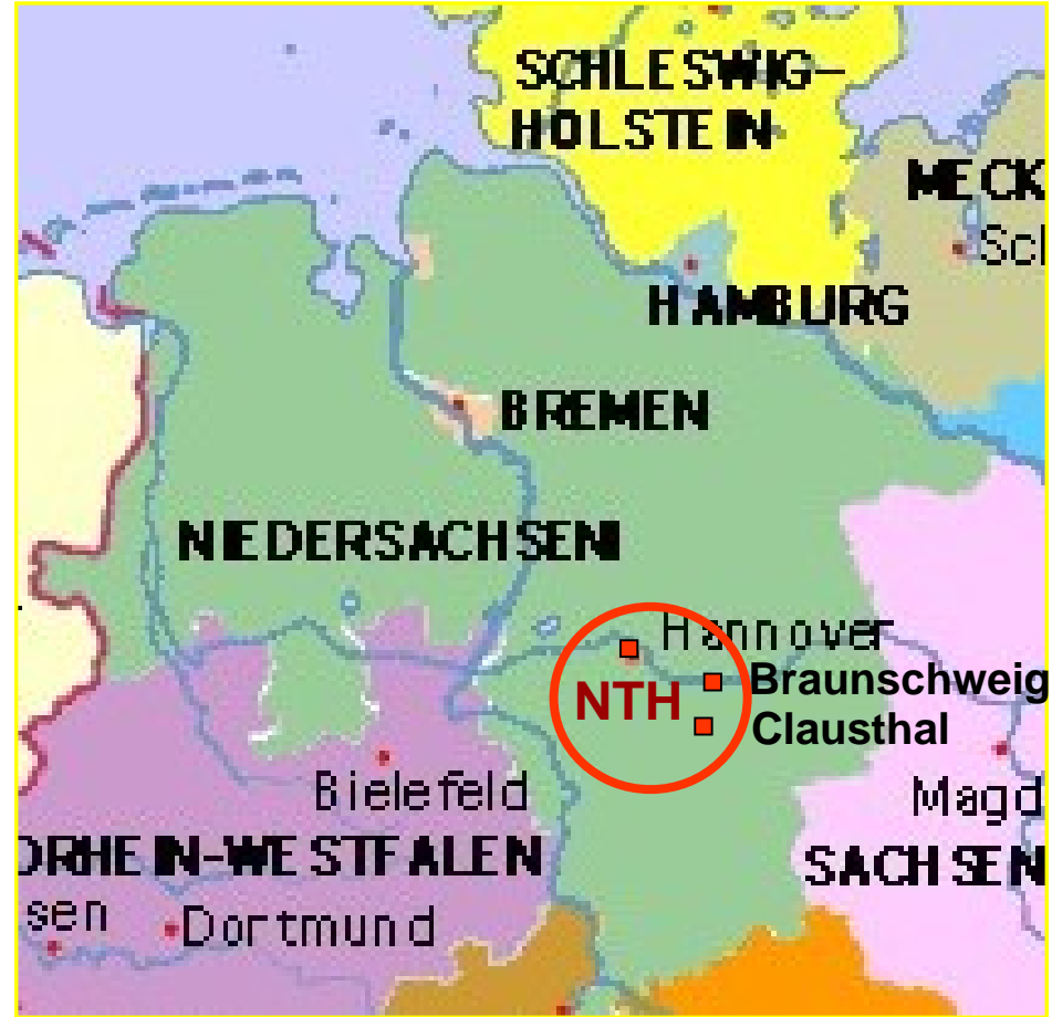
Niedersächsische Technische Hochschule NTH