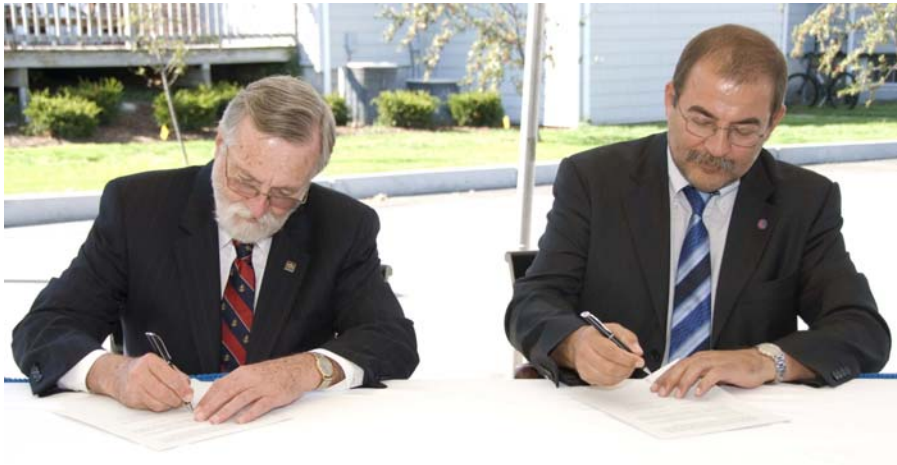
Signing the Dual Degree Doctorate September 28, 2007