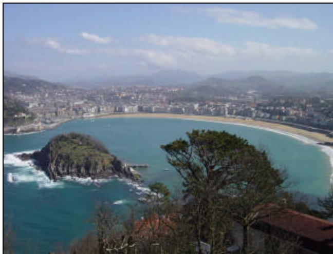
Playa de la Concha, San Sebastián.

Donostia, San Sebastián es una ciudad preciosa, tiene las playas más bonitas que he visto en mi vida. Esta ciudad tiene bastantes lugares turísticos y por lo tanto muchos turistas, tiene mucha vegetación, la ciudad es preciosa y diferente a las otras ciudades españolas que conozco, ya que tiene un toque de estilo francés.