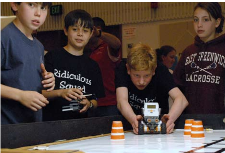
A group of middle school students make their final preparations before competing in URITC's Robotics Challenge, held in May at URI. See story and photos on page 4.