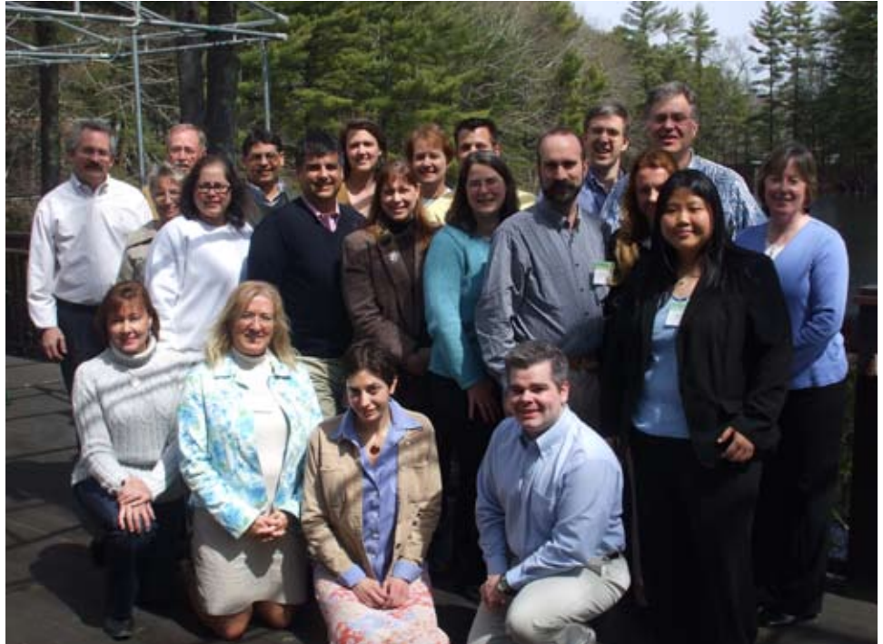
Attendees of the 2008 Region One LTAP meeting held at URI's W. Alton Jones campus.