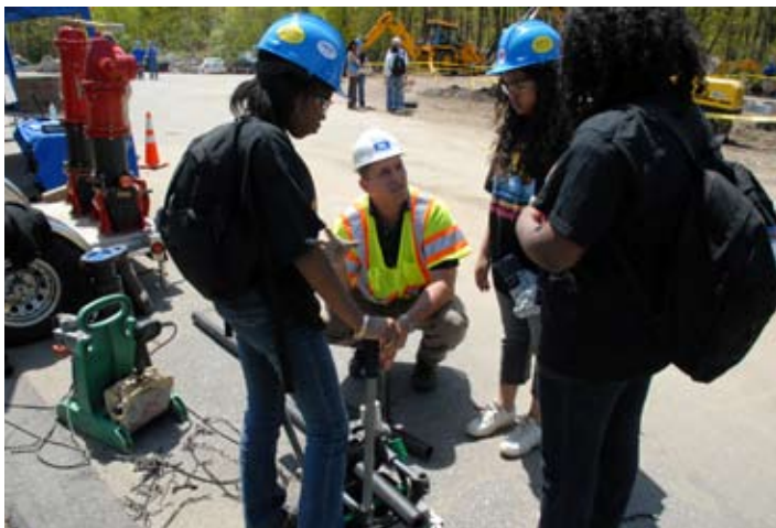
Three students learn about pipefitting.

Coventry facility hosted Construction Career Days (CCD). The event was sponsored by RIDOT and the Federal Highway Administration.